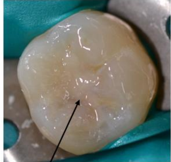
A sealant is applied to chewing surface of molars