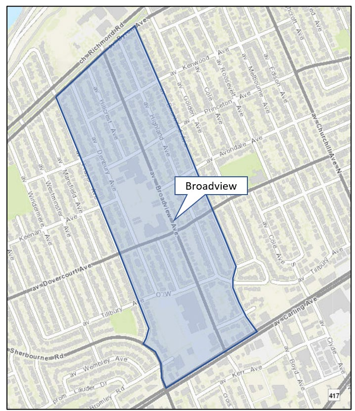
Figure 4: Aerial view of Broadview Avenue and neighbouring areas

Figure 3: Survey responses by area of residence