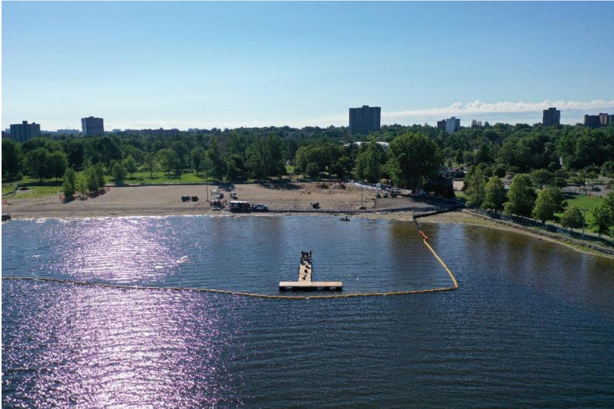
Photo: View of the Britannia Beach, sectioned off for the dredging project

For more information about the Britannia Beach Dredging project, click here .