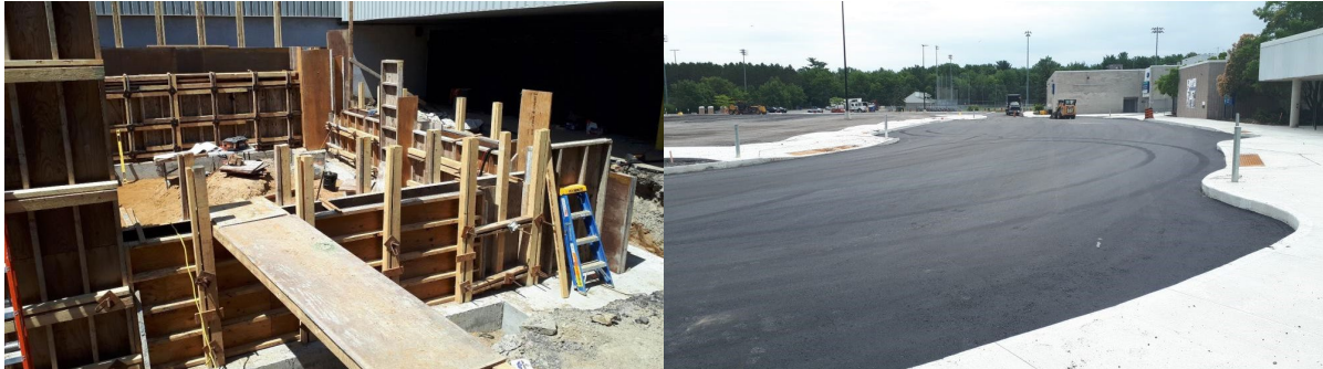
Photo Left: Paving of east parking lot near entrances 2, 3 and 4 of the Nepean Sportsplex Photo Right: Installation of new HVAC system in the pool