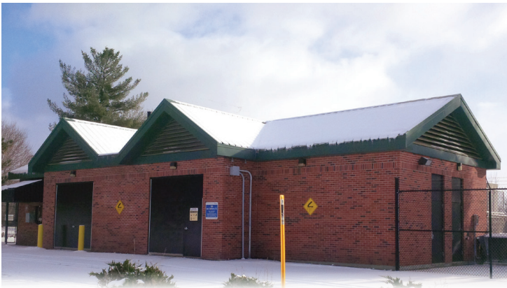
Carp Pumping Station

A wellhead protection area (WHPA) is the area around a well where land use activities have the potential to affect the quality of water that flows into the well. The size and shape of a WHPA is determined by the amount of water being pumped and the direction and speed at which the groundwater travels through the aquifer to get to the well.