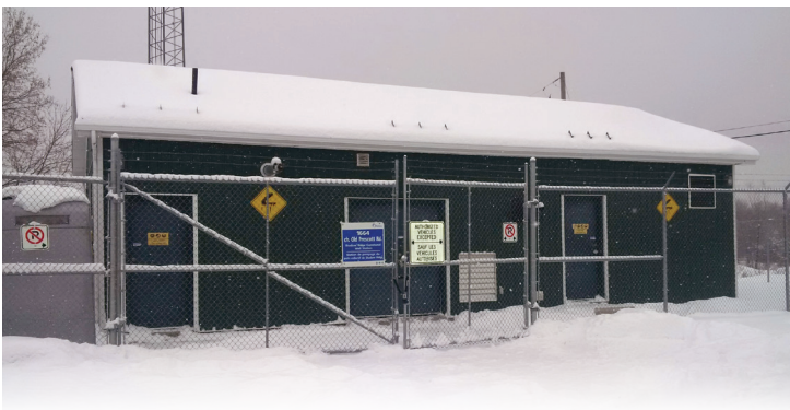
Shadow Ridge Pumping Station

A wellhead protection area (WHPA) is the area around a well where land use activities have the potential to affect the quality of water that flows into the well. The size and shape of a WHPA is determined by the amount of water being pumped and the direction and speed at which the groundwater travels through the aquifer to get to the well.