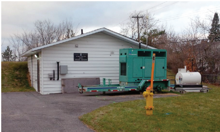
Munster Pumping Station

A wellhead protection area (WHPA) is the area around a well where land use activities have the potential to affect the quality of water that flows into the well. The size and shape of a WHPA is determined by the amount of water being pumped and the direction and speed at which the groundwater travels through the aquifer to get to the well.