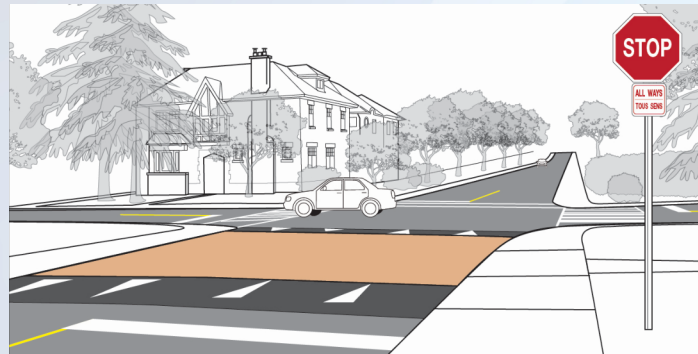
➤ Raised crosswalk