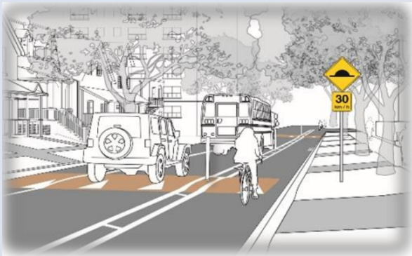
➤ Speed hump