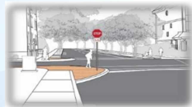
➤ Curb extension