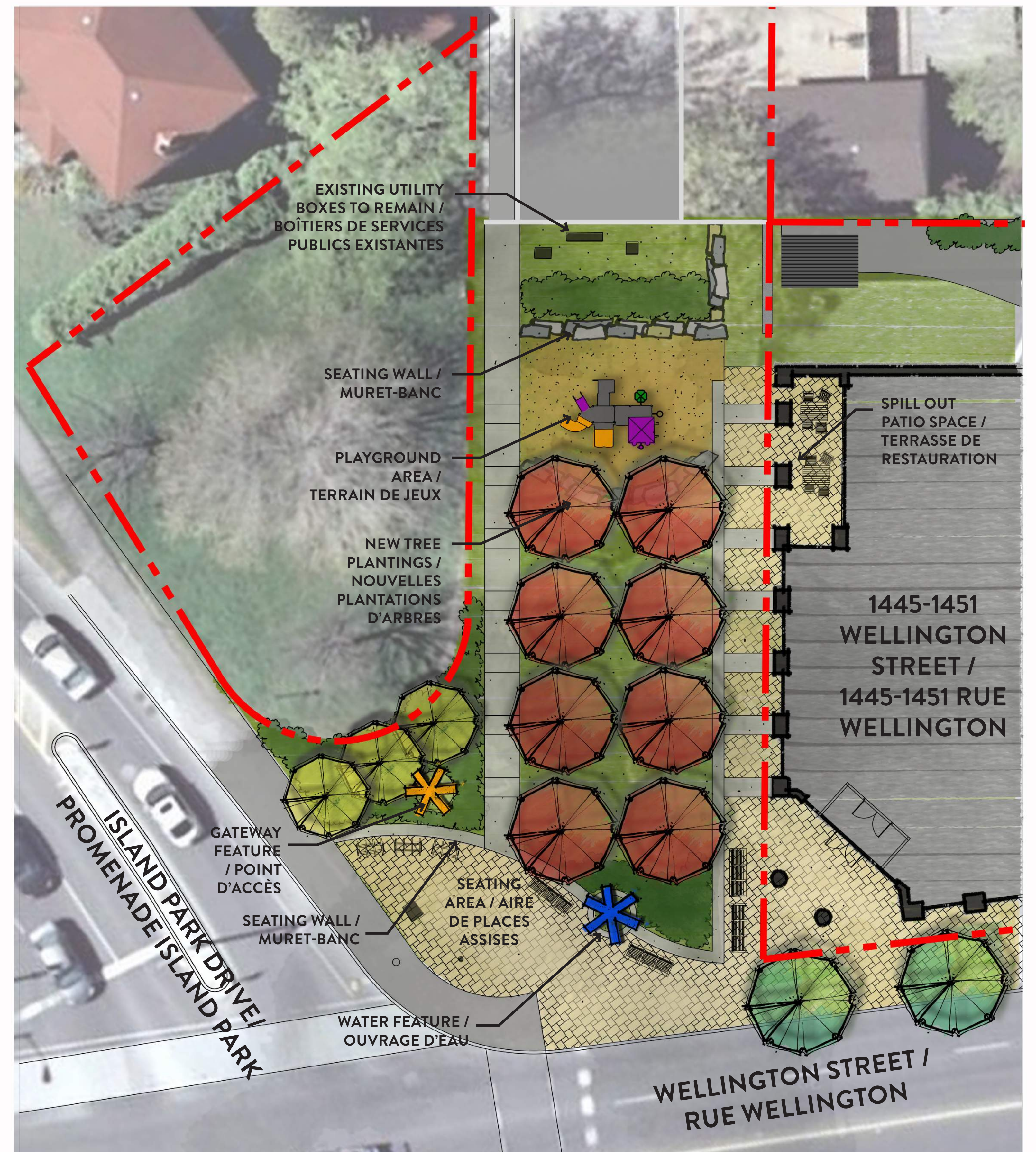
PARK IDEA #4