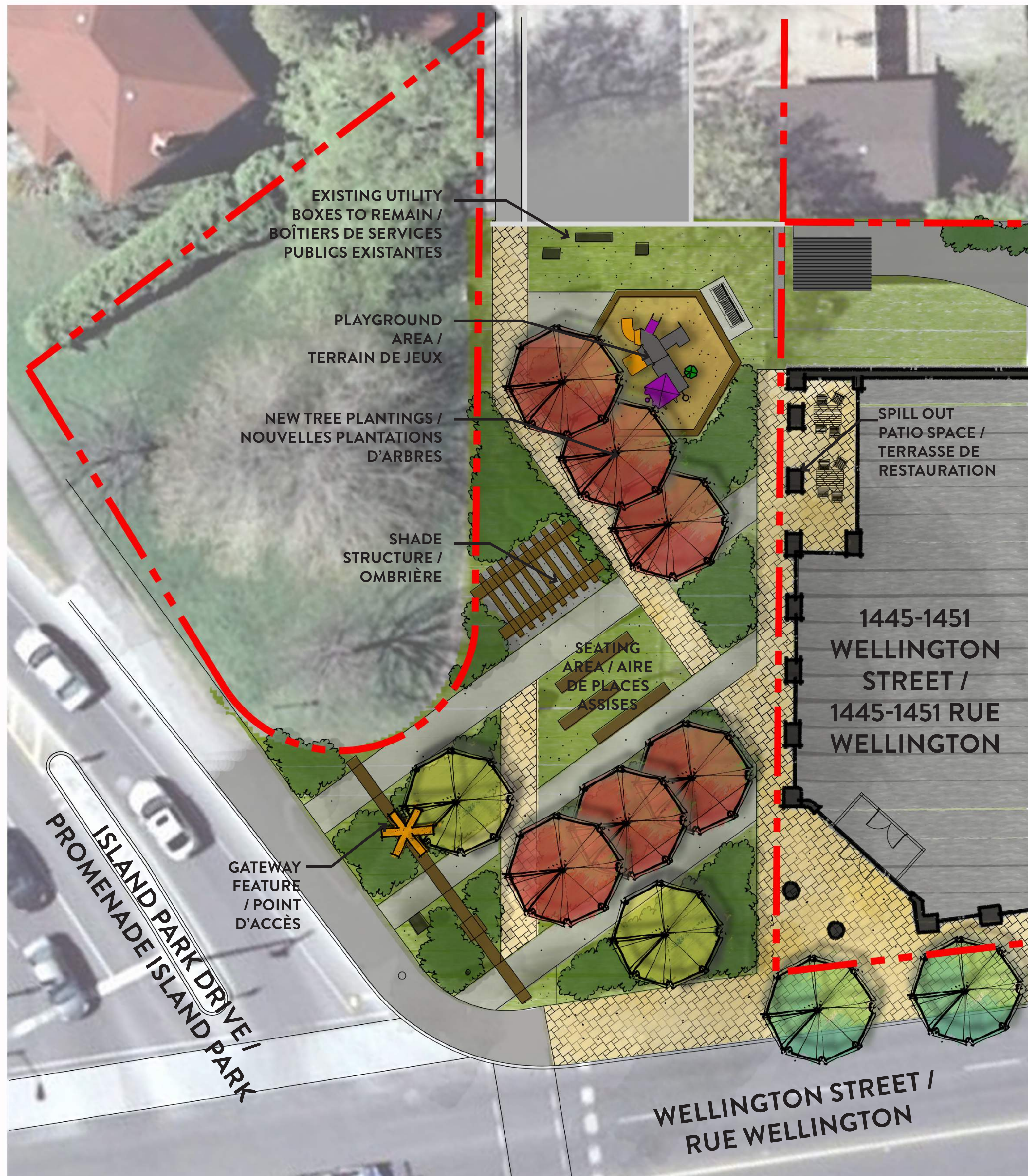
PARK IDEA #3