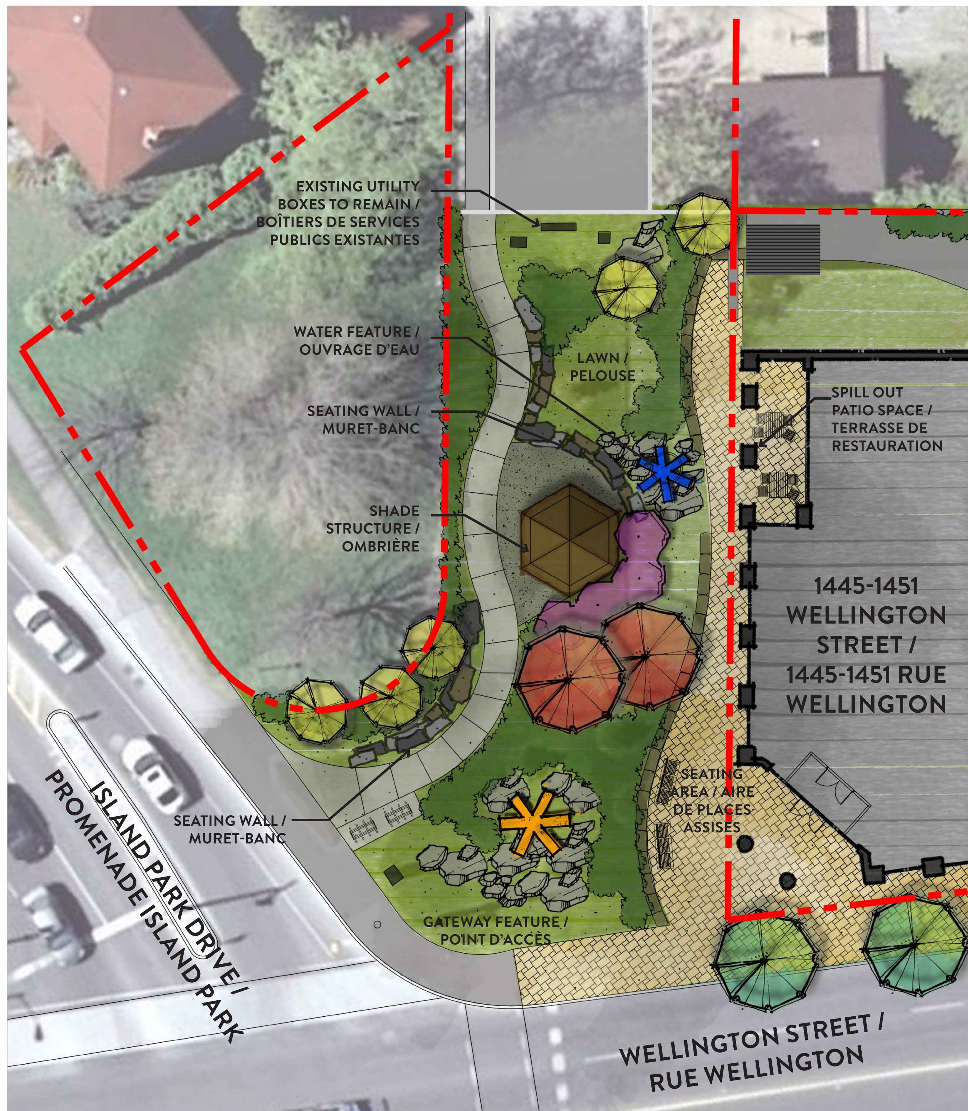
PARK IDEA #1