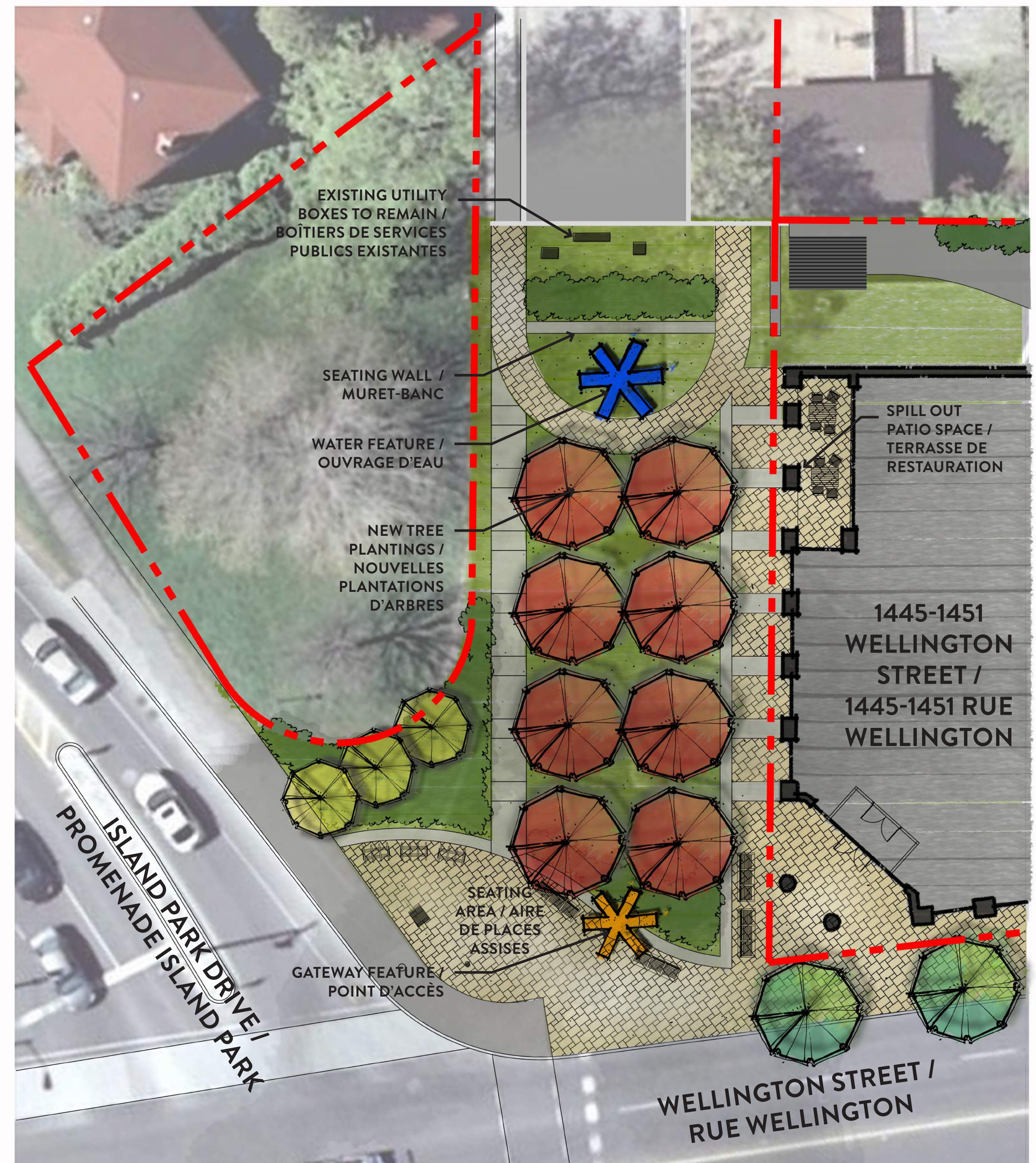
PARK IDEA #2