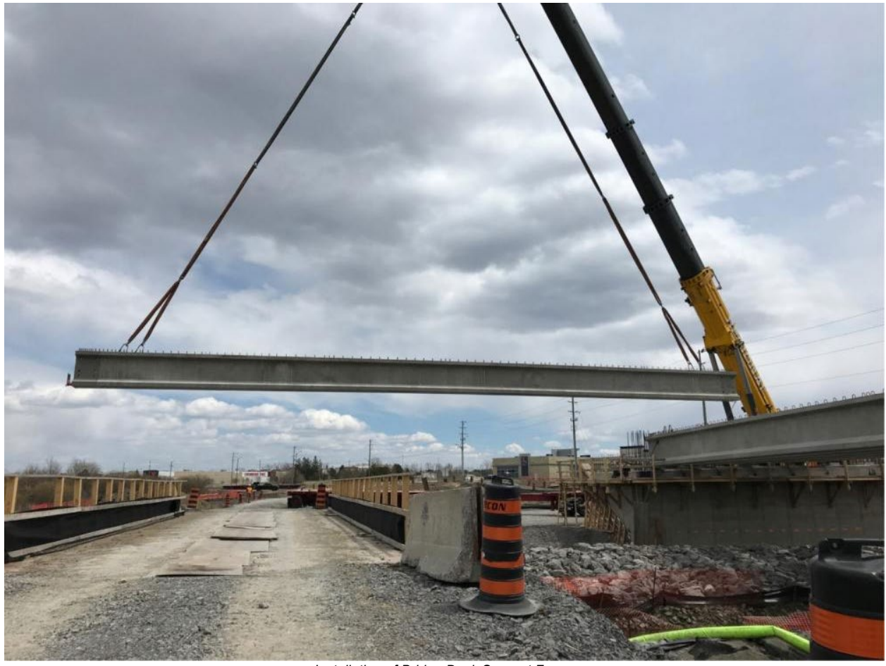
Installation of Bridge Deck Support Frame