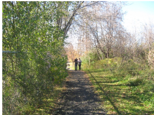
Existing pathway between Brookfield Road and Bank Street (MMM Group, 2010)

Lack of greenspace and landscaping is evident along the corridor and was noted frequently during the consultation process. There will be a concerted effort to ensure that the amount and quality of greenspace is improved in the study area. A greenway is proposed along the former rail line that parallels Bank Street to the west. Landscaping and tree planting is encouraged wherever feasible along the streetscape within the public and private rights-of-way. The existing City-owned pathway and park system should be improved and new pathways should be developed near the Ledbury Park area.