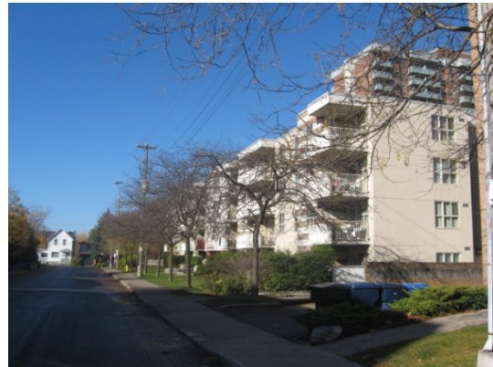
Example of intensification that complements the surrounding area (MMM Group, 2010)

The planning strategy for the CDP is built upon policies and guidelines established by the Official Plan (OP). The OP designates the Bank Street portion of the CDP study area as Arterial Mainstreet and designates Billings Bridge Shopping Centre as a Mixed Use Centre. There are two Transitway stations and a future LRT station within walking distance of the study area. The CDP is consistent with the policies and guidelines set out in the Urban Design Guidelines for Development along Arterial Mainstreets (2006) and the Transit Oriented Development Guidelines (2007).