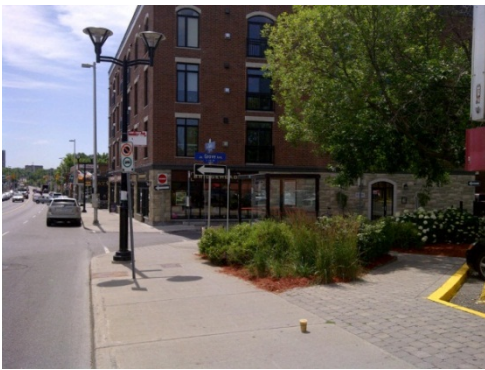
Animate the streetscape with buildings close to the sidewalk, lighting fixtures, and landscaping (MMM Group, 2010)

Furthermore, the smaller lots on the east side of the street will not be negatively impacted by removing development viability on one or both sides of the street because large property takings are not required. The modified cross-section also provides greater opportunity for tree plantings in the setback, a more comfortable walking environment and a pedestrian refuge on the median while ensuring capacity is available for traffic flow and on-street cycling lanes.