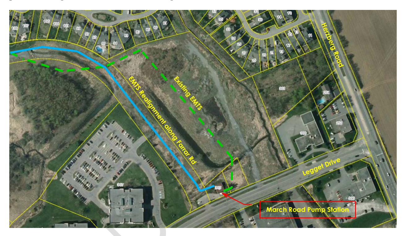
Figure 4: Project Location

Concurrent with the March Road PS upgrades the City may wish to realign the East March Trunk Sewer (EMTS) to the Farrar Road right-of-way. The existing location of the East March Trunk Sewer and its potential realignment are shown below in Figure 4.