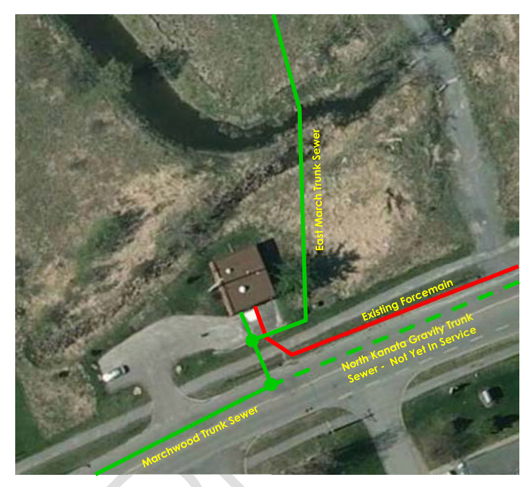
Figure 2: Current Connections to March Road PS