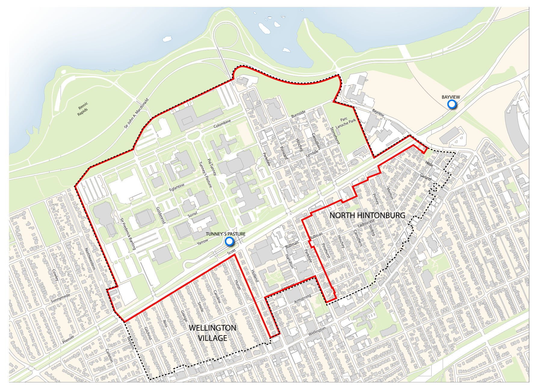
CDP STUDY AREA

Within the modified CDP boundary is an area identified through the study process where physical improvements are most desirable and hence will be the focus for the CDP.