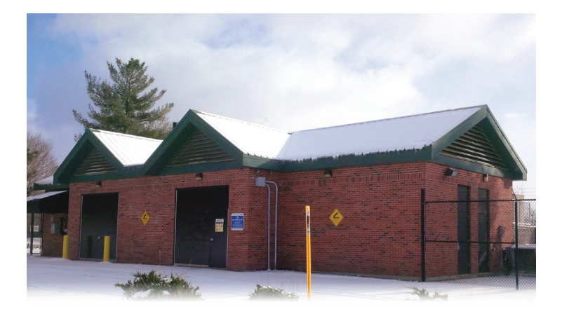
Carp Pumping Station

A wellhead protection area (WHPA) is the area around a well where land use activities have the potential to affect the quality of water that flows into the well. The size and shape of a WHPA is determined by the amount of water being pumped and the direction and speed at which the groundwater travels through the aquifer to get to the well.