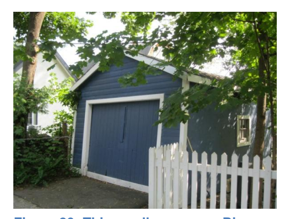
Figure 20: This small garage on River Lane is typical of the small scale wooden garages and former carriage houses found throughout the HCD.