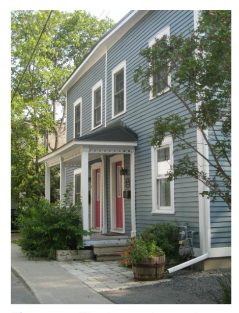
Figure 19: The house located at 3-5 Avon Lane was constructed in 1874 and is an early example of the development along the lanes. It is located close to the street and is compatible with the scale of Avon Lane.