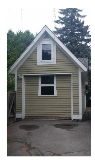
Figure 17: This small garage on River Lane is modestly scaled and in keeping with the character of the neighbourhood.

New garages and accessory buildings shall be designed and located to complement the heritage character of the HCD and the design of the associated building. In general, new garages should be simple in character with a gable or flat roof and wood or stucco cladding.