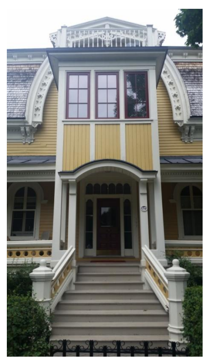
Figure 13: An elaborate New Edinburgh Heritage Conservation District F<sub>Street</sub> wooden porch at 34 Alexander