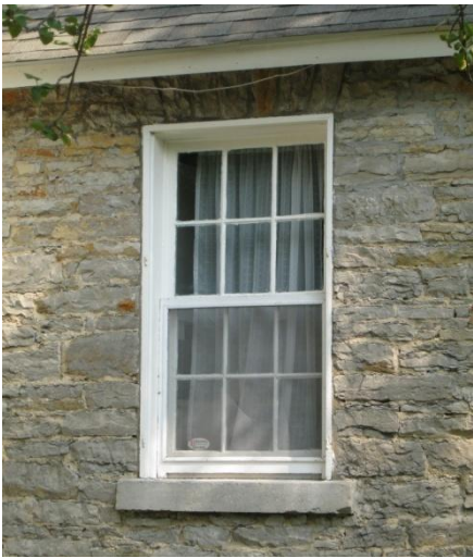
Figure 11: Historic windows were generally sash windows with multiple panes and constructed out of wood.

Original wood windows and storm windows should be retained and conserved wherever possible and when replacement is required, only those windows that are beyond repair may be replaced. Energy efficiency can be achieved with existing windows through the