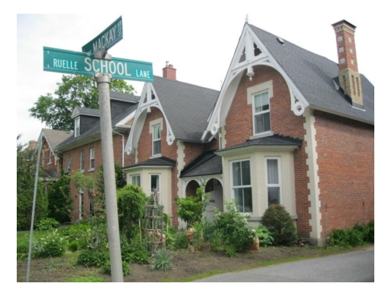
Figure 7: The Woodburn House, 73-75 MacKay Street is an important Gothic Revival house in the HCD.

v. To ensure that additions to existing buildings are compatible with the character of the HCD.