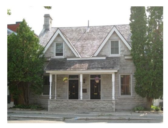
Figure 1: The Garvock House at 139-141 Crichton Street is an early stone cottage in the HCD and is designated under Part IV of the OHA.

ensure that the heritage character is protected for future generations.