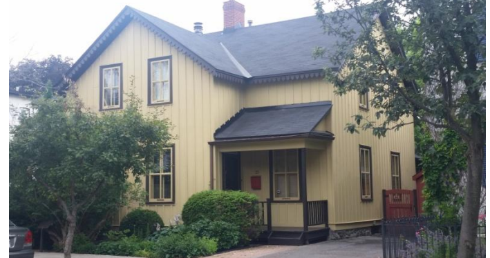
Figure 10: The board and batten wood siding of this house on Crichton Street is an important heritage attribute that should be preserved.