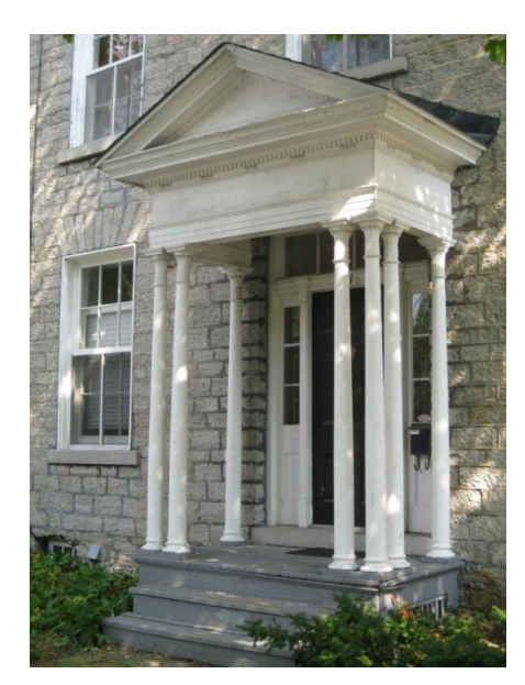
Figure 12: The entrance of this house is characterized by the door, transom window, and sidelights.