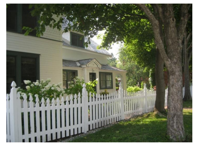
Figure 3: The Bell House is located at 151 Stanley Avenue and is designated under Part IV of the OHA.

There are 17 buildings located within the boundaries of the HCD that are individually designated under Part IV of the Ontario Heritage Act for their cultural heritage value. These buildings were designated prior to the designation of the district in 2001 and while each has its own Statement of Cultural Heritage Value and is subject to the requirements of Part IV of the OHA, the provisions of this Plan will also apply.