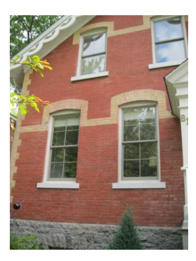
The image on the left shows repointing completed with the wrong type of mortar which doesn't match the original in colour, texture or composition. The photo on the right shows the same house after the repointing was re-done by an experienced mason.