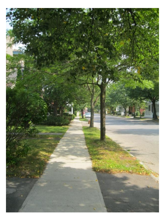
Figure 8: The tree lined streets of New Edinburgh contribute to the overall sense of place.

v. To promote appropriate public and private landscaping that will enhance the character of the HCD.