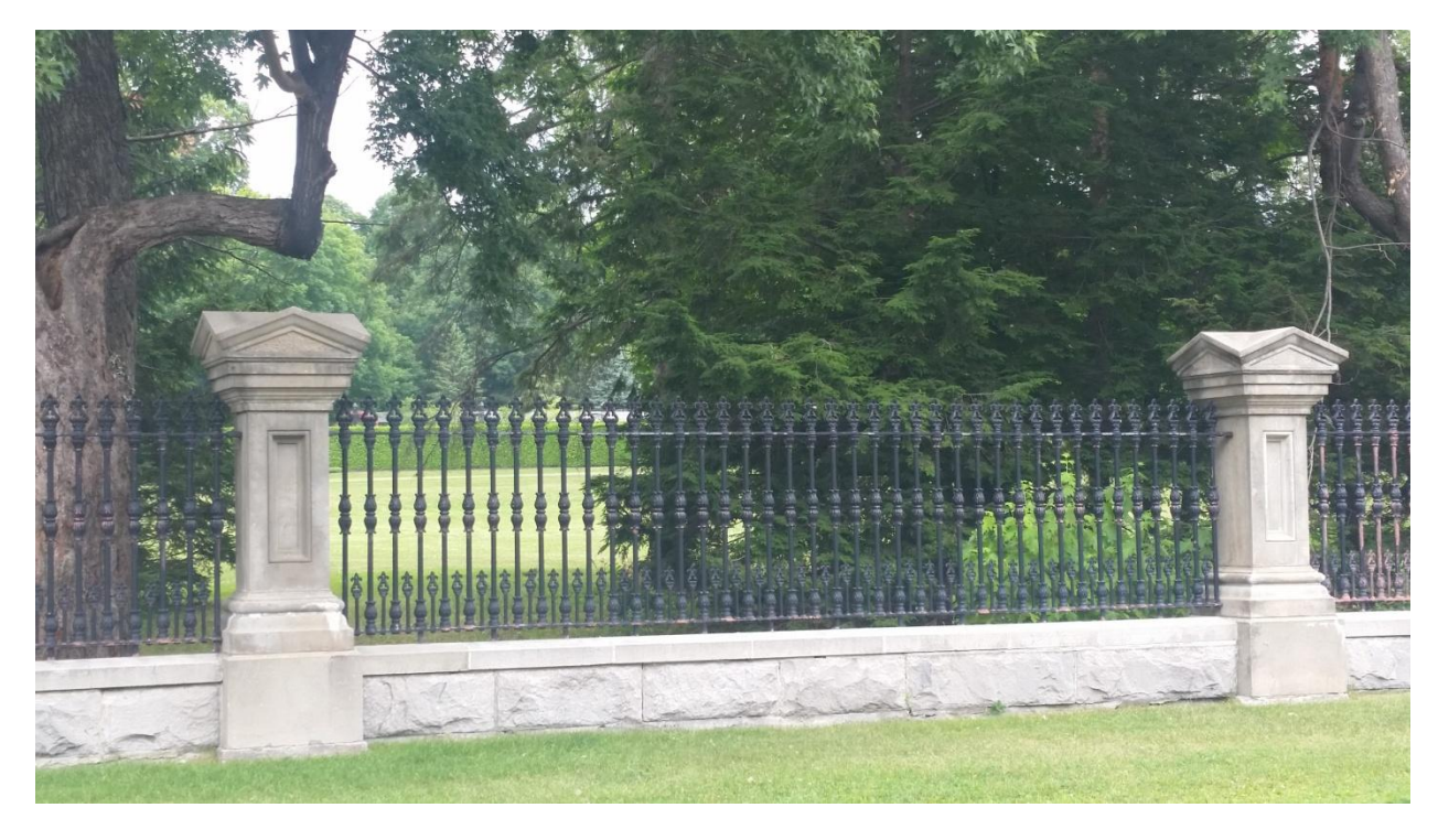
Figure 2: The stone and wrought iron fence along MacKay Street demarcates the grounds of Rideau Hall, one of two large green spaces located adjacent to the HCD.

The New Edinburgh HCD is also located adjacent to many sites of local and national importance including Thomas MacKay's former estate, now the home of the Governor General, Rideau Hall, the Prime Minister's Residence at 24 Sussex Drive and the Minto Bridges, which were constructed to provide a ceremonial route between Rideau Hall and the Parliament Buildings. The proximity of these important sites contributes to the sense of the place in New Edinburgh.