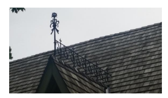
Figure 9: The cedar roof of St. Bartholomew's Church was recently restored.