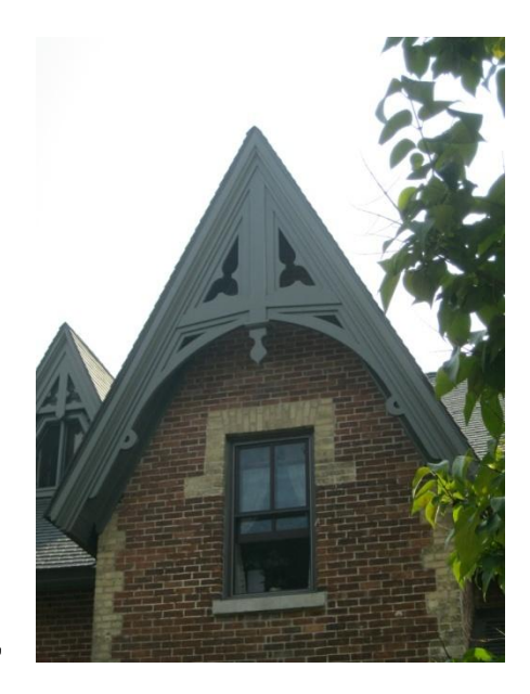
Figure 14: The Frechette House, 87 MacKay Street features decorative bargeboard in the gable ends.