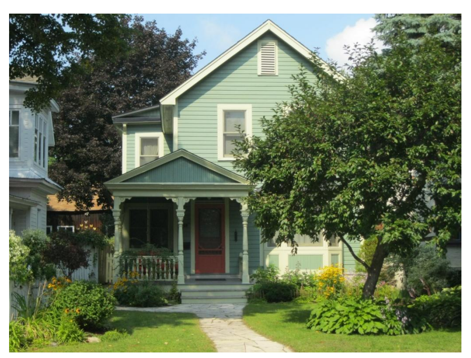
Figure 16: 116 Stanley has a sympathetic addition at the side that does not negatively impact the character of the building.