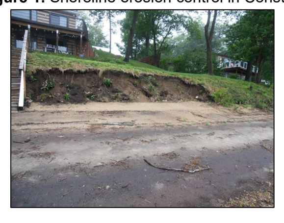
Figure 1. Shoreline erosion control in Constance Bay following 2017 flooding event

Most erosion control projects (a non-farm project type) have occurred along the Rideau River beginning in Manotick and continuing upstream. Another hotspot for erosion control projects is along the Ottawa River near Constance Bay, as this community was severely impacted by flooding in 2017 and 2019 (Figure 1). Sixteen projects have been completed, or are underway, within the City's urban wards, including 10 well decommissioning projects and 5 agricultural projects.