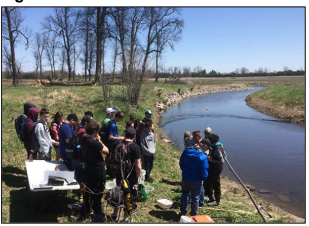
Figure 4 – Grass buffer demonstration site along South Castor Municipal Drain

A series of targeted promotional activities were undertaken in an effort to highlight priority agricultural project types that have had limited uptake. A grass buffer demonstration site was developed on Stoodley Farm along the South Castor Municipal Drain (Figure 4), and a fact sheet and video were prepared and posted on the City of Ottawa and South Nation Conservation websites. In addition, the Stoodley Farm Demonstration Site was a featured stop on SNC's Watershed Tour in 2019. Two short videos highlighting a farmer's experience with controlled tile drainage were produced and are available on SNC's YouTube channel.