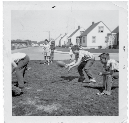
Photo: 1955 photograph of Harrold Place. Courtesy Lee Wainwright and The Vets Neighbourhood Kids Facebook Group

Heritage Planning heritage@ottawa.ca 613-580-2463