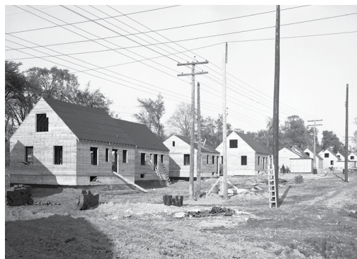
Photo: Wartime homes on Carling Avenue, mid-construction, 1945 / City of Ottawa Archives / CA024990