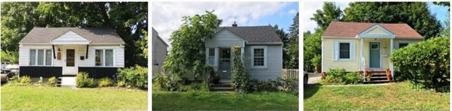
Photos: Veterans' homes along Fisher Avenue (946, 958, 914), Ottawa, September 2021

This document is intended to be used in conjunction with all other relevant municipal and provincial planning policies and by-laws, including the Zoning By-Law, Merivale Road North Community Design Plan and relevant urban design guidelines.